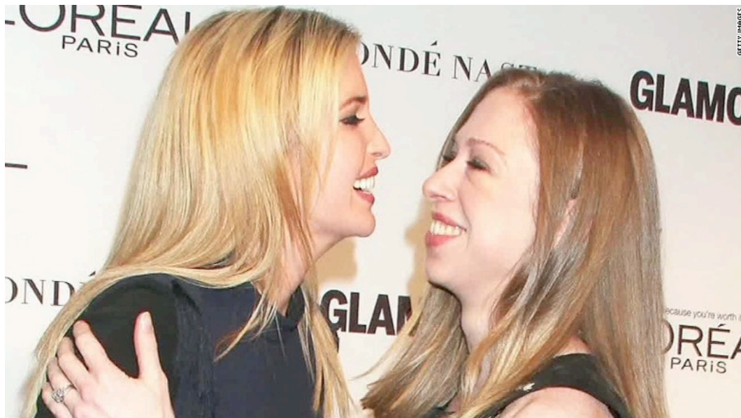
Figure 2: Ivanka Trump and Chelsea Clinton embrace

She is, in essence, the poster-girl for Bernie’s “political revolution” and that fact will come out over the course of the campaign.