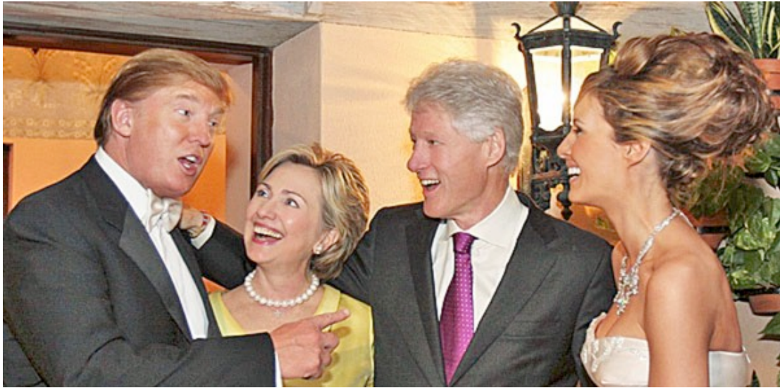
Figure 3: The Clintons and the Trumps having a laugh together at Trump's wedding