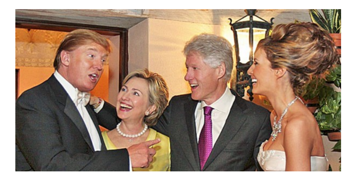
Figure 3: The Clintons and the Trumps having a laugh together at Trump's wedding

Figure 2: Ivanka Trump and Chelsea Clinton embrace